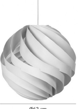
Ø62 cm Large