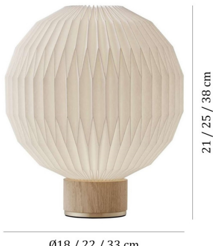
Ø18 / 22 / 33 cm